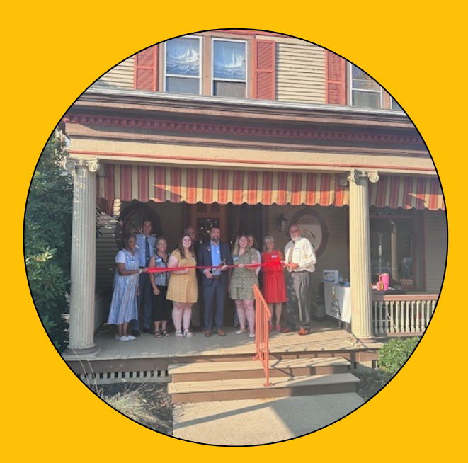
Visit Us at Our New Location: 1322 Elk Street, Franklin, PA 16323

Learn more about the Technical Career Investment Program and BBCF: